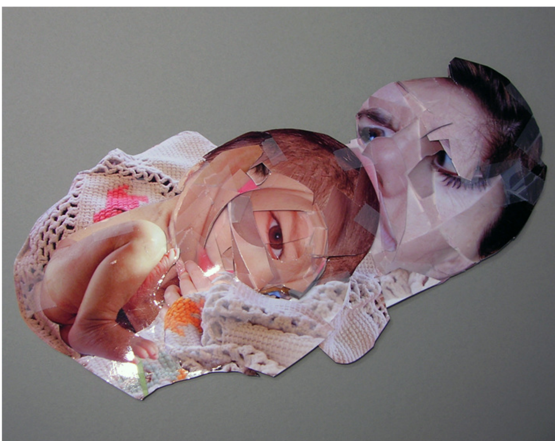
Josephine Taylor Untitled (Mother & Baby) at Catharine Clark Gallery

This playful amusement of getting a rare taste of a mixed constellation without criteria might be the first recognition of deducing this multi-layered envision. Many natural references, a lot of Black and White were several times tagged with red dots of purchase. The small boot spaces make some of the great photography want to set off the cheap fair walls and aim for a different environment.