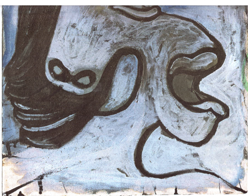
"Portrait de Dora Maar," 1939, by Pablo Picasso (1881-1973), oil and gouache on paper, at Galerie 1900-2000 in the Galleries sector of Art Basel